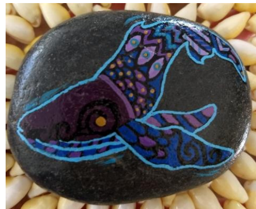
One of many rock painting examples by Rebecca Locklear.