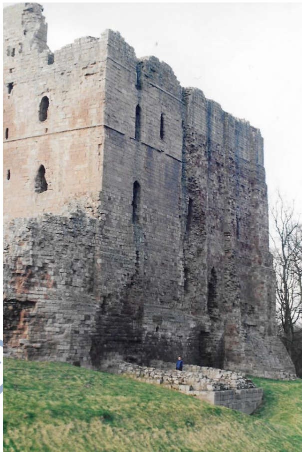
A student stands in front of the keep. England